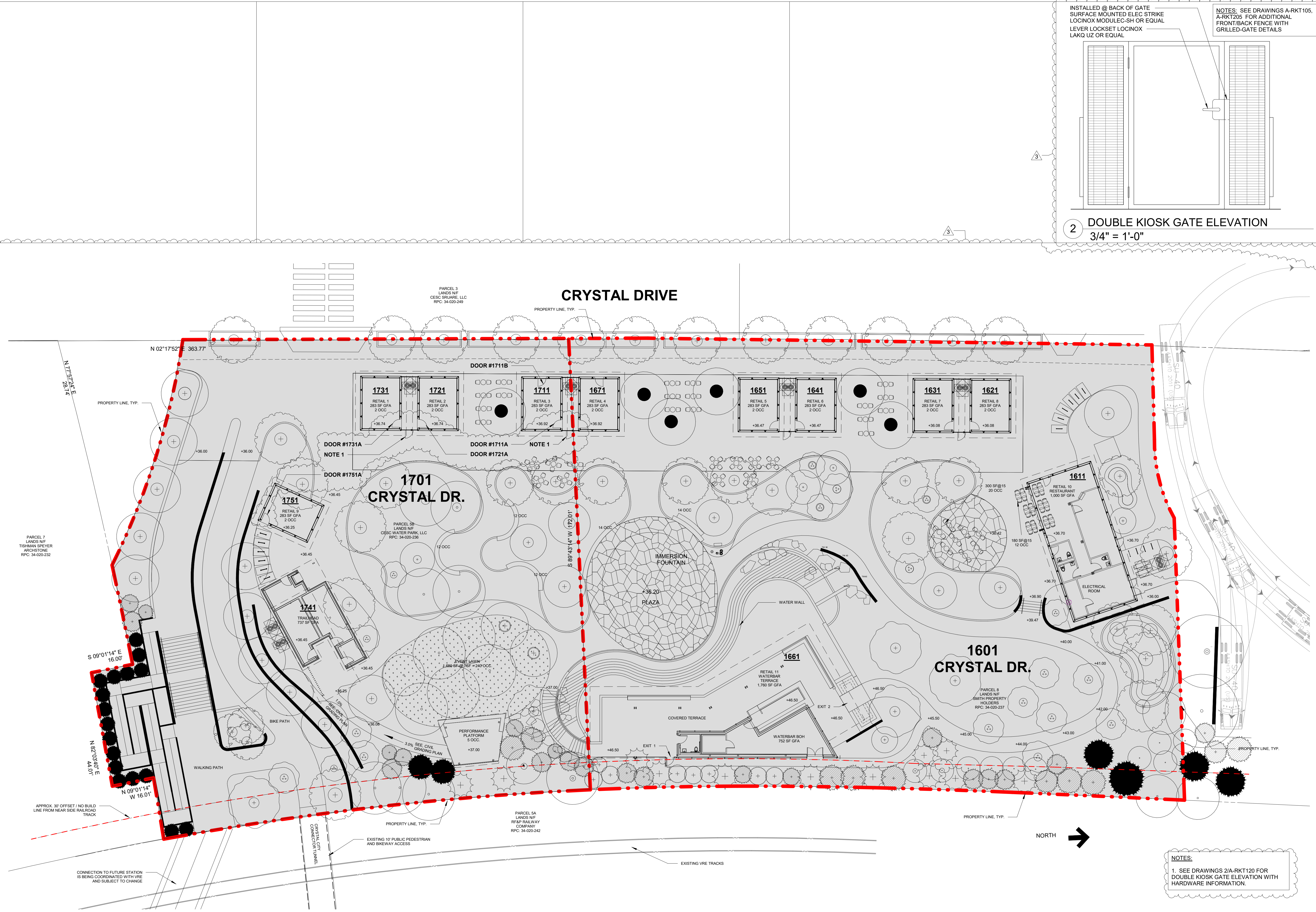
1 KIOSK DOOR KEY PLAN - 1701 SITE 1/16" = 1'-0"

NOTES: 1. SEE DRAWINGS 2/A-RKT120 FOR DOUBLE KIOSK GATE ELEVATION WITH HARDWARE INFORMATION.